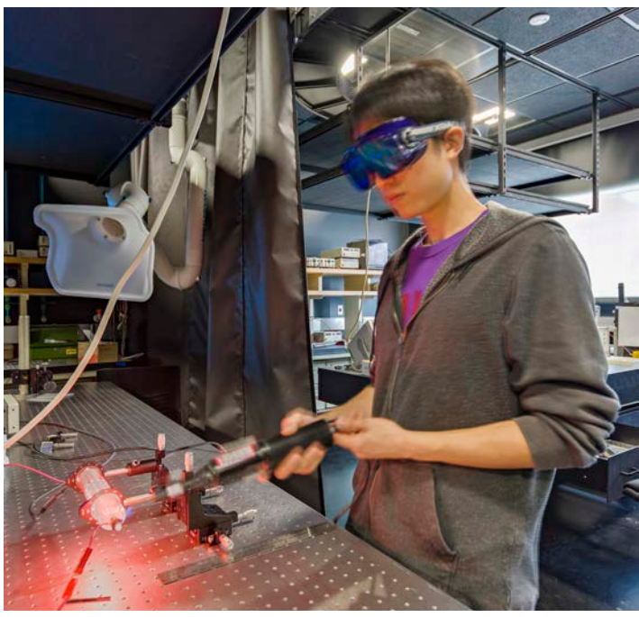
UNIVERSITY OF ILLINOIS, URBANA-CHAMPAIGN