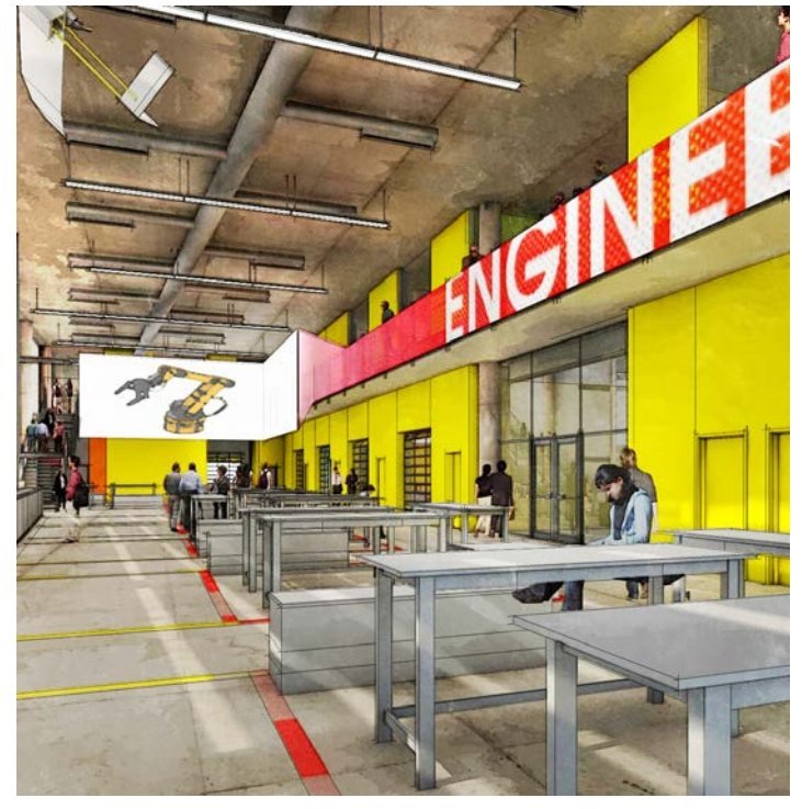
UNIVERSITY OF ARIZONA

Engineering space must provide a balance between theory, hands-on learning and the lab. It's very important that students have an opportunity to "make" as part of their educational experiences. Space should be large enough to accommodate diverse teams, yet flexible enough to provide individuals with their own workspaces. Beyond space in the engineering building, the Advisors felt strongly that if there's an incubator space on campus, engineering students should have access to it.